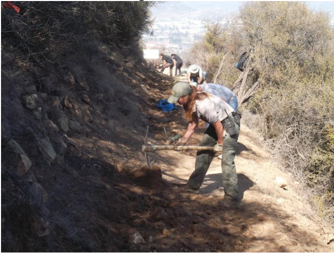
Volunteers restoring the trail