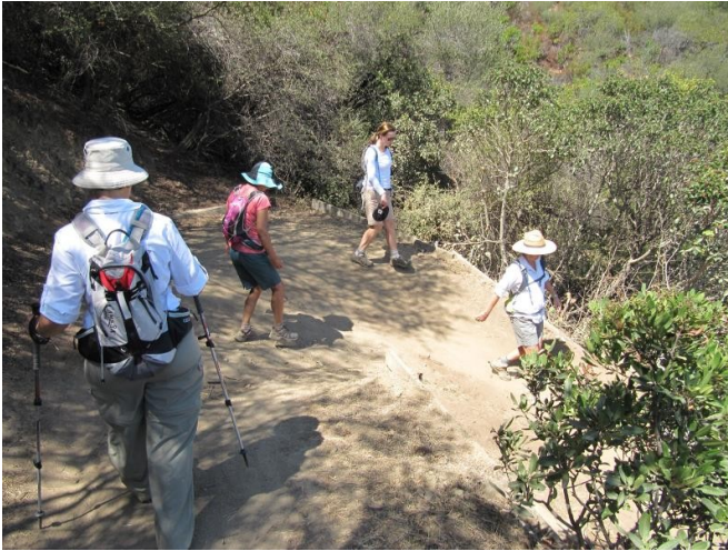
The section with switchbacks